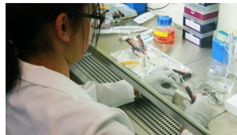
Working with T-cells

Within that time they have to be isolated, prepared for their spaceflight inside 'experiment units' which must then be checked for integrity, passed to SpaceX technicians for loading aboard Dragon,