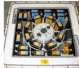
Kubik incubator with centrifuge